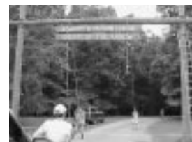
Lodge Gateway Sign

After watching my brother and father enjoying the Order of the Arrow for the last four years, I knew it was something that I wanted to be a part of. So, after being named on the ballot this spring, I was really looking forward to the campfire ceremony at the Spring Camporee. When it finally arrived, two other boys in my troop were "called out" at the ceremony. As I sat there and began to wonder if I had made it, my brother called out my name.