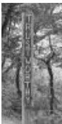
Scout Law Sign

At the end of a long day was the highlight of the weekend (other than dinner), my Ordeal Ceremony. I was really impressed, because a lot of work had obviously gone in to preparing the ceremony. I really enjoyed it, but I'm also looking forward to seeing it again at the next ordeal, when I will not be so tired. The best thing about cracker barrel after the ceremony was being able to talk all I wanted to.