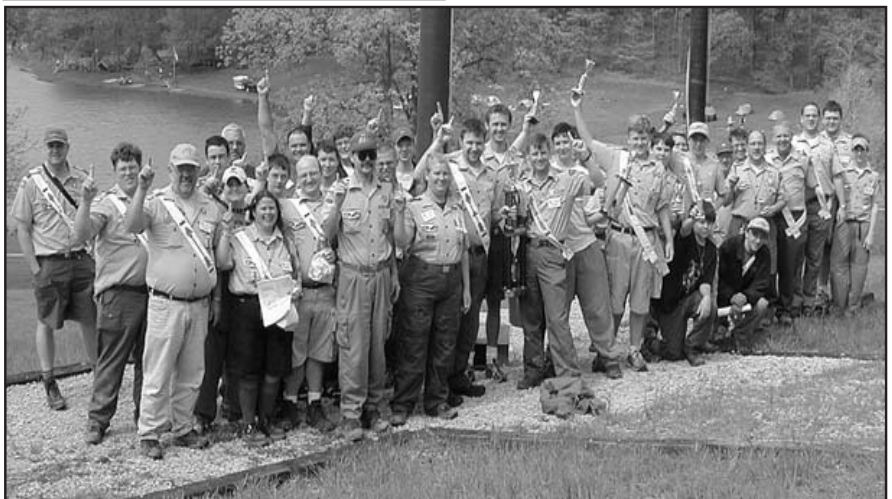
Wa-Hi-Nasa Arrowmen revel over their fourth consecutive Quest for the Golden Arrow victory at the 2002 Section SR 6N Conclave.

In addition to the manual labor of the Fall Ordeal, it is also the last opportunity to nominate individuals for the Vigil honor. All nominees' applications must be in before the Vigil meeting, Sunday of the Ordeal. The year is half way through, yet we should approach the remaining events with as much vigor as we did with those that have passed. I look forward to seeing you at the ordeal. If you have any questions, feel free to contact me by e-mail at TCBY121@cs.com .