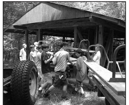
Ordeal Candidates work together to help set up Boxwell Reservation for the upcoming summer.

This is our last chance for the year to induct new members, and they are the lifeblood of our lodge. But, new candidates cannot do it all. We need current members to be there to encourage the new members and get ....continued on page 2