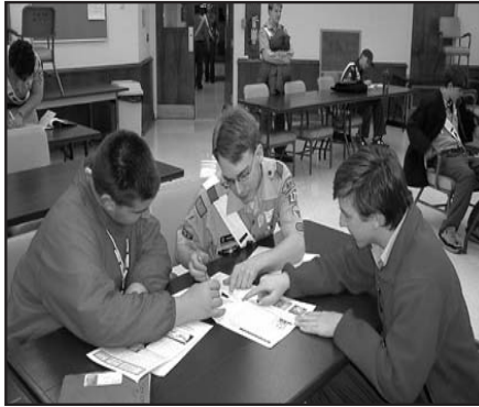
Arrowmen study a copy of the Flying Eagle at the OAU newsletter class.

developing the leader within you, to communications. Some Arrowmen learned how to produce a newsletter. Some Arrowmen learned how to run lodge events. Other arrowmen learned how to make regalia and dance while still others learned all the special nuances of the three-legged deer chapter. Training went smoothly all morning. By lunchtime, everyone was famished. It was time for food for the stomach rather than food for the