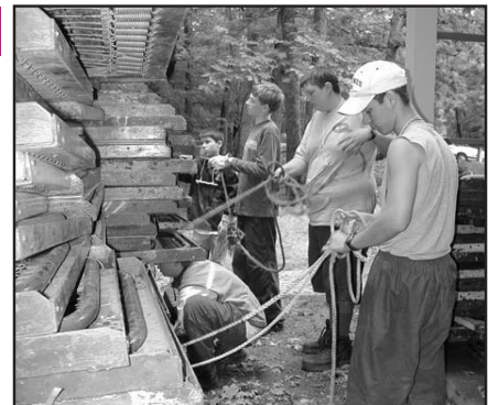
Ordeal Candidates work diligently to set up summer camp at last year's Spring Ordeal.