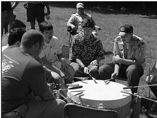
American Indian Events such as drumming are an integral part of Wa-Hi-Nasa.