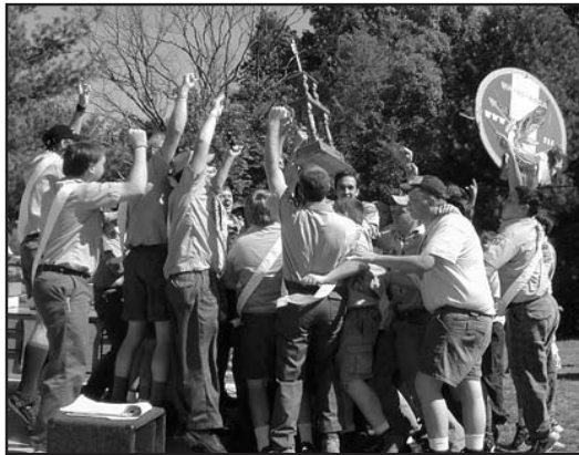
Wa-Hi-Nasa Arrowmen revel over their Quest victory at the 2001 Conclave.

Lodge won the Quest for the Golden Arrow trophy for the third time in a row last year, and was able to retire that trophy. It can be seen in the lodge with the one that Wa-Hi-Nasa retired earlier. We need another one!!