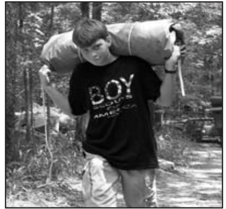
This Arrowman knows what Cheerful Service is all about.

Arrowmen, your lodge dues are due on or before January 1, 2003. You are asked to complete the Universal Lodge Registration Form and send it in to the Scout Office. Dues paid before December 31 are $9.00. After January first, the cost is $12. Remember, a Scout is thrifty, so get your forms in soon. You will be able to register in person at the Winter Banquet. Gold cards are once again available, and are a great deal!