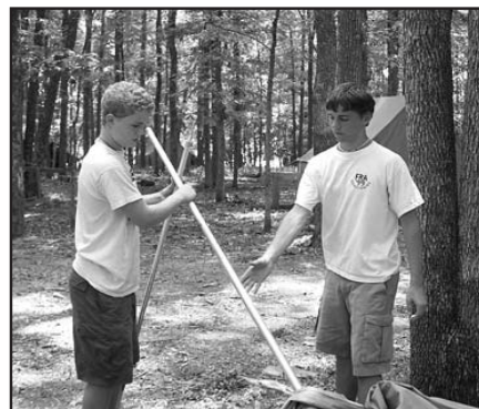
Ordeal Candidates diligently take down tents at Boxwell Reservation during the Fall Ordeal.