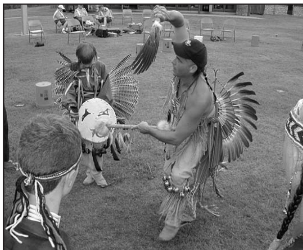
Lodge members participate in AIE at the 2002 Wa-Hi-Nasa Lodge Fall Fellowship.

Cracker Barrel on Saturday night. At the Cracker Barrel, new members were finally free to chatter away and they showed it. In the morning, the flag was raised, breakfast was had, and the new Ordeal Members went back to their homes. Thanks to everyone for a very successful Fall Ordeal!