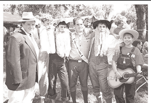
Wa-Hi-Nasa's Champion lipsyncing team

answer any quandaries you stumble into as you try to sign up and get on board for this great event.