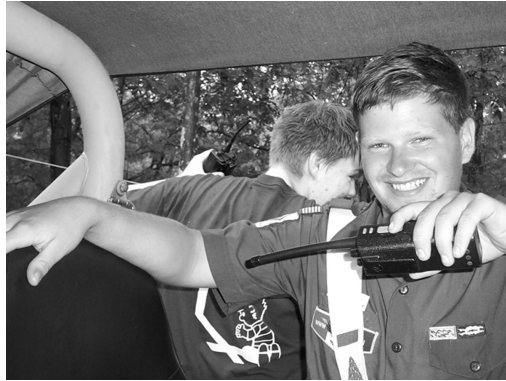
There is a job for everyone at Ordeal!

purposes. Now that I have talked alot about the work for the week-end, here is the fun part. Many of you have heard of the new swimming pool opening for summer camp on May 15. We have received special permission to have a grand opening pool party on Friday of Ordeal! This is really going to make a great event become even more enjoyable, so remember to mark your calendar for June 4-6, and lets have a great Ordeal!