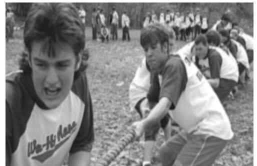
Wa-Hi-Nasa's Own Champion Tug-O-War Team!

Plan Book, Where to go Camping Guide, and our Flying Eagle to be judged in the publications event. Where they all did extremely well! In case you haven't heard, Wa-Hi-Nasa placed first over all in the quest. For those of you who were there I would like to thank you for your participation and effort towards winning the Quest and having a great weekend. This was an event whose memories will stay with Wa-Hi-Nasa for quite some time!