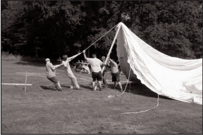
The member crew tackles the circus tent.