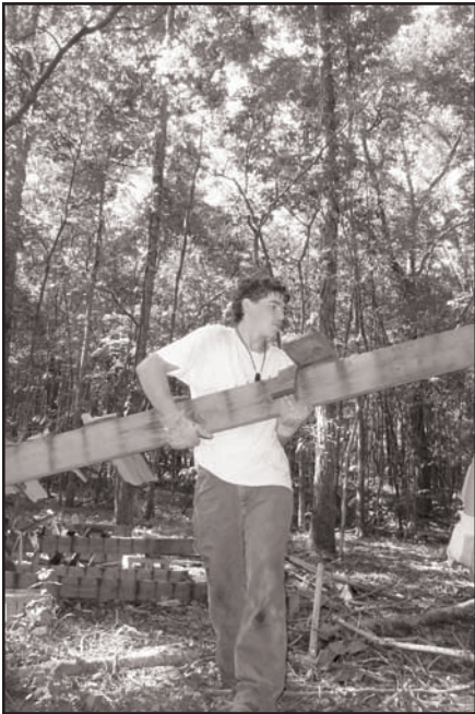
Candidates help to repair platforms in Craig.