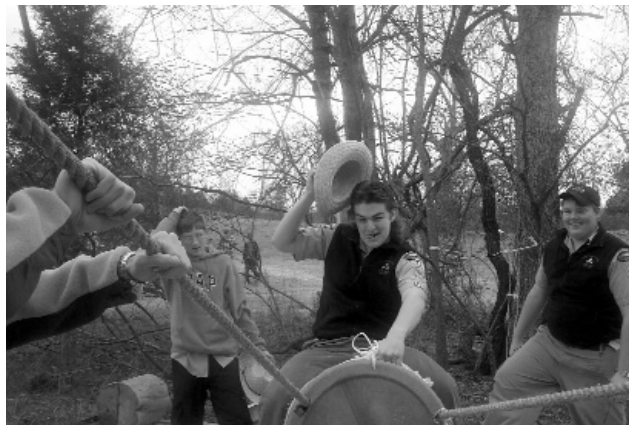
A scouter riding the bucking bronco and havin' a great time. Yee Haw.