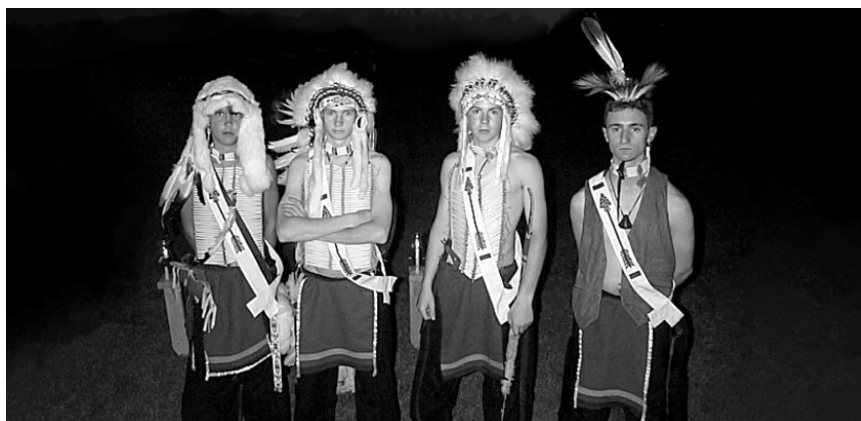
These guys had a blast performing ceremonies.