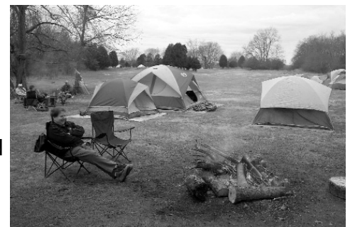
Winter Camp, December 27-31 Boxwell Reservation