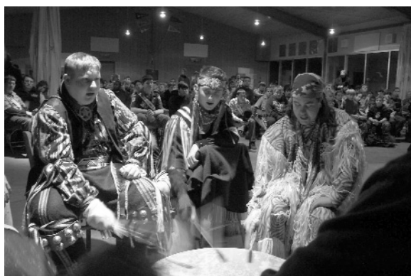
A Native American Drum Team performing at Winter Camp.