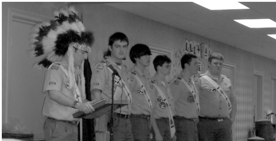
The newly elected 2005 officers are inducted