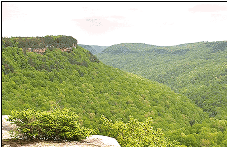
Latimer High Adventure Reservation