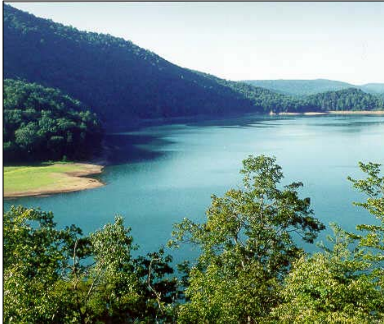
George Washington and Thomas Jefferson National Forest, Virginia where Wa-Hi-Nasa Lodge will send an ArrowCorps 5 contingent in 2008.

forest make it an excellent center for outdoor activities. The forest covers 140 miles along the Appalachian Mountains in northwestern Virginia and in eastern West Virginia.