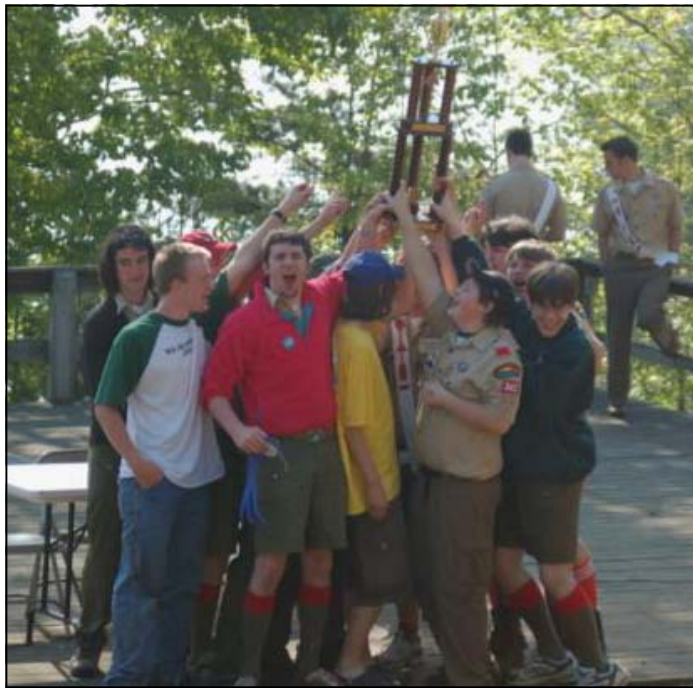
Wa-Hi-Nasa proudly hoists the Quest Trophy at the 2007 Section Conclave.