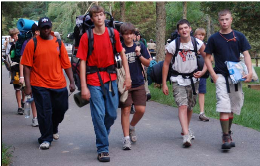
OA Candidates beginning their journey at the 2008 Spring Ordeal.

Looking for a way to jump start your active participation in the Order of the Arrow? There is no better place to start than signing up to serve as an Elangomat at the 2009 Fall Ordeal. This is a great opportunity to lead others in service as you guide our newest Arrowmen into Scouting's national honor society. To sign up, just ask your camp's OA representative or email: elangomat@wa-hi-nasa.org .