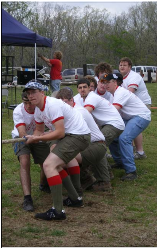
Wa-Hi-Nasa is victorious at the 2008 SR-6N Conclave Tug-O-War Competition.

Congratulations to our 26 lodge members who attended the first ArrowCorps 5 session at Mark Twain National Forest. More are headed to Bridger-Teton and Shasta/Trinity National Forest later this summer. It may not be too late to join them at these or other ArrowCorp 5 sites! Talk to your camp's OA representative today to find out how to sign up!