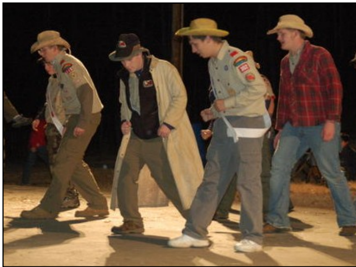
Arrowmen stage the closing show at the 2008 Winter Camp. Come be a part of the fun in 2009!