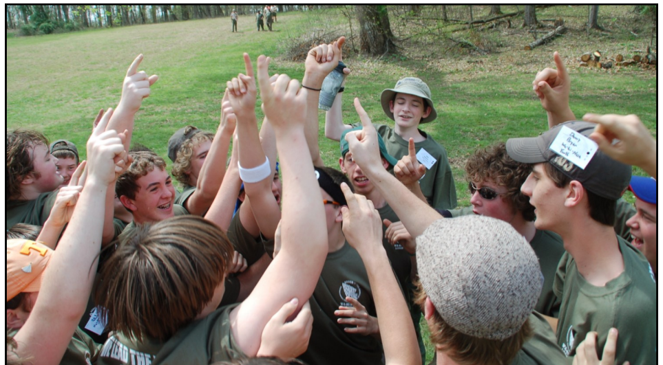
Wa-Hi-Nasa Lodge Members fired up at the 2009 SR-6 Conclave.

We've got plenty to do to get ready for our neighbors to descend on Boxwell and we need your help! The Fall Ordeal is our only Ordeal between now and Conclave. Make sure you are a part of this exciting event, right in our own backyard!