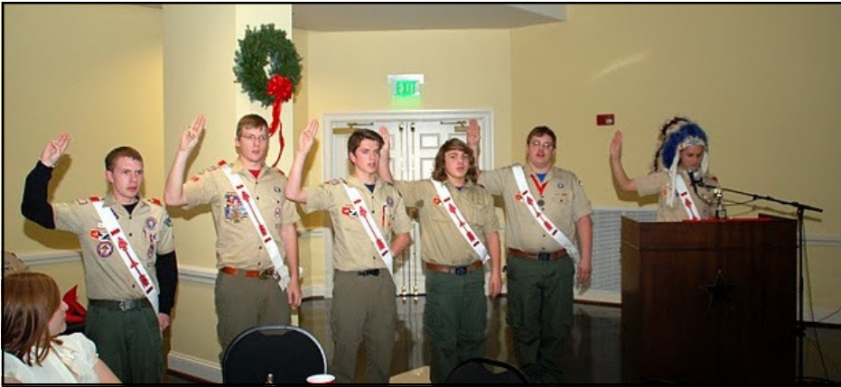
2010 Lodge Officers are sworn in at the Winter Banquet.