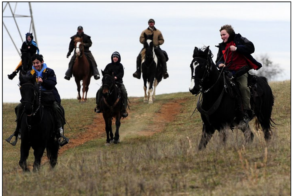
Arrowmen and Scouts enjoy horsemanship at Winter Camp.