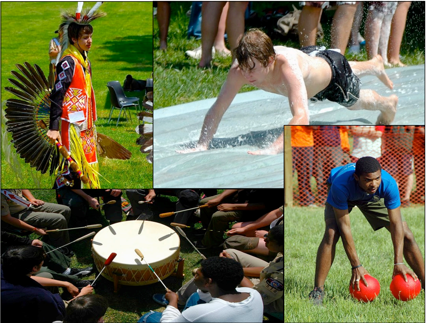
Conclave 2010 (clockwise): Ceremonies, World's Longest Slip'n Slide, Quest Events, & AIE Training