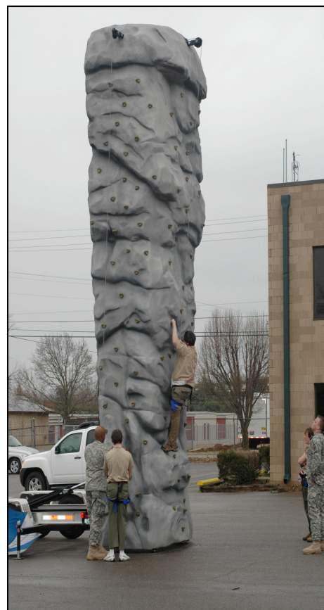
Arrowmen rock climb at OAU.

A special thanks goes out to all of our OAU training staff who helped kick 2010 right with a great Order of the Arrow University.