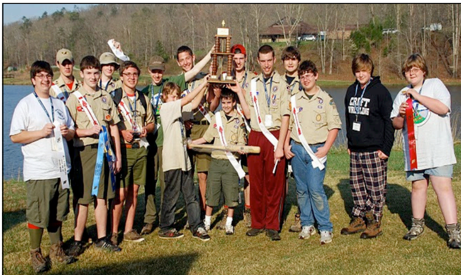
Camp Crooked Creek, KY—Wa-Hi-Nasa Lodge members take the Quest for the Golden Arrow Trophy at Conclave 2011.

Wa-Hi-Nasa Arrowmen spent the weekend of April 8-10 having a great time with Arrowmen from around the Section at the SR-6 Conclave. Each year the section hosts a Conclave as a gathering for Arrowmen of the section. There are few other events of this magnitude throughout the year that showcase the pillars of our Order: brotherhood, cheerfulness, and service.