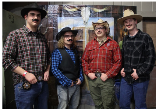
during Spring Shindig 2019, Wild Wild West!