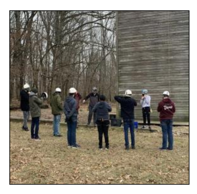
Scouts Learn Climbing Safety At the COPE Tower

quality service, and clean facilities that campers have always experienced. Thanks to all the staff that made it possible. Do not miss next year's winter camp which will be back to the regular dates, and bigger than ever!