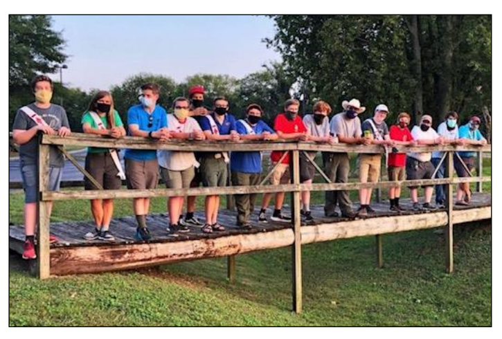
Nendawen Chapter Ice Cream Party 2020

Unit Election Season, one of the best seasons in the lodge, requires a great deal of work. Achieving the goal of 90% unit visitation this year will be a journey, very much like the metaphorical journey to find the arrow at our inductions. Arrowmen across the lodge should each realize that their individual contributions to the unit elections effort are significant. These efforts and contributions will make Order of the Arrow programs available to more Scouts in the Middle Tennessee Council. Act today, and get involved! We need your help! Contact your chapter chief to see what you can do help with Unit Elections.