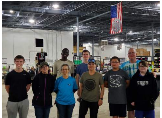
Anawaha Chapter performing service project!

If your unit has not yet had an election yet, please reach out to us at unitelections@wa-hi-nasa.org to schedule a unit election for your unit. If you want to help your local election team, get in contact with your chapter chief at www.wa-hi-nasa.org/chapters!